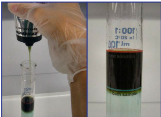
2) Adding test solution