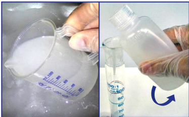
1) Sampling / Decanting

In order to achieve consistent cleaning results, the user has to ensure that the cleaning agent concentration stays within the recommended application range. Factors such as “drag-out”, dilution, and evaporation influence the cleaning agent concentration in the cleaning bath, so it is highly recommended to take regular measurements of all process related parameters. The ZESTRON® Bath Analyzer 10 is a simple, easy-to-use method which provides reliable and accurate results for either fresh or contaminated cleaning baths.